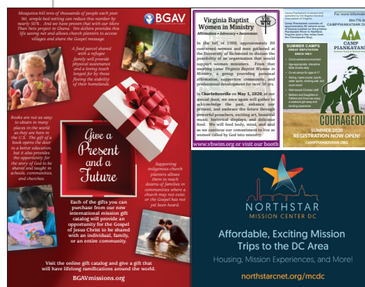
sample ad sizes from 2019

Please submit artwork no later than Friday, September 26 to ministryfair@bgav.org .