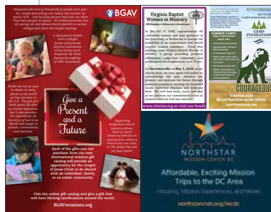
sample ad sizes from 2019

Please submit artwork no later than Friday, September 22 to annualmeeting@bgav.org .