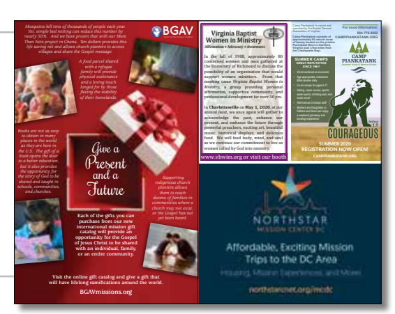
sample ad sizes from 2019